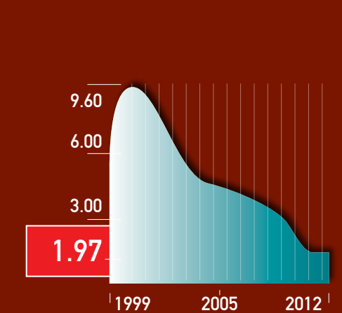
OSHA RECORDABLE RATES